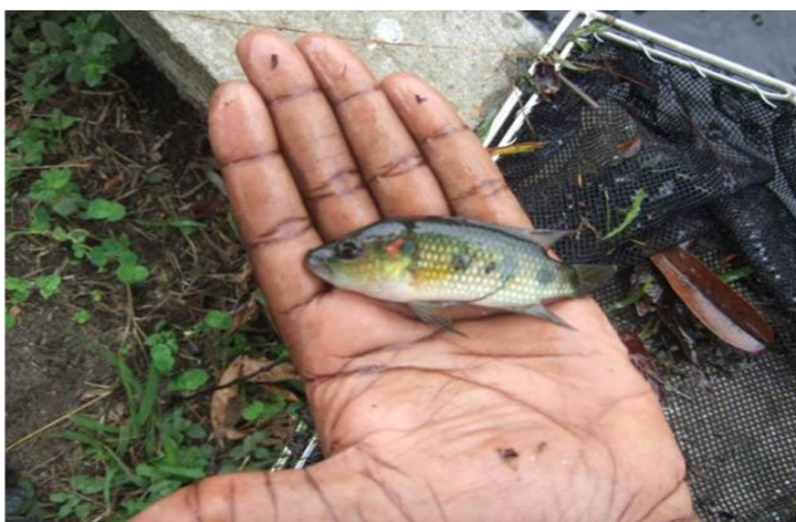
Figure 2. Hemichromis fasciatus fish

Alternative biological control methods, especially the use of larvivorous fishes, can play a significant role in controlling of mosquito larvae. Some of larvivorous fishes are important predators of mosquito larvae. In fact, in the current study, after the introduction of fed larvivorous fishes in each of the five glass jars, the number of larvae of Anopheles gambiae s.l. was reduced. In addition, after the introduction of unfed larvivorous fishes in each of the five glass jars, the number of larvae of Anopheles gambiae s.l. was dramatically reduced. These results showed that larvivorous fishes ate more larvae of Anopheles gambiae s.l. when they were unfed than when they were fed. The presence of fish food in glass jars may play a role by limiting the eating capacity of the larvivorous fishes. In fact, because of the presence of fish food in glass jars, larvivorous fishes first tried to eat this food before eating larvae of Anopheles gambiae s.l. The results obtained after the introduction of unfed larvivorous fishes in glass jars showed that the larva-eating capacity of these fishes was high.